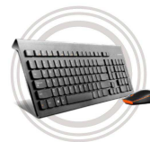
Lenovo 500 Wireless Combo Keyboard & Mouse

* Example of Lenovo IdeaCentre AIO catalogue naming convention