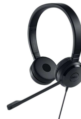
DELL PRO STEREO HEADSET - UC350

The smart choice for dual-display productivity with a 21.5" screen, full range of adjustable features, slim borders, and multiple connectivity points.