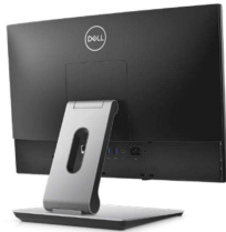
OPTIPLEX 5270 ALL-IN-ONE ARTICULATING STAND

Tilt your display forward, backward, or recline to a 60 degree angle. This stand makes touchscreen interaction comfortable.