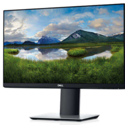
DELL 22 MONITOR - P2219H

The smart choice for dual-display productivity with a 21.5" screen, full range of adjustable features, slim borders, and multiple connectivity points.