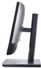
OPTIPLEX 5270 ALL-IN-ONE DVD+/-RW IN HEIGHT ADJUSTABLE STAND

Raise, tilt, pivot or swivel your All-in-One with a stand that delivers personalized comfort and viewing angles.