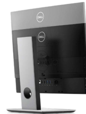
OPTIPLEX 5270 ALL-IN-ONE HEIGHT ADJUSTABLE STAND

Tilt your display forward, backward, or recline to a 60 degree angle. This stand makes touchscreen interaction comfortable.