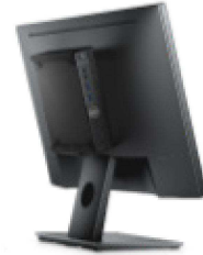
OPTIPLEX MICRO ALL-IN-ONE MOUNT FOR DELL E SERIES MONITORS

Small footprint mounting solution adapts to your environment, with cable management and monitor height adjustability, tilt, swivel and pivot functions.