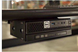
OPTIPLEX MICRO DVD+/-RW ENCLOSURE

Mount your system between two VESA compatible devices. Includes an adapter box to securely house the system's power adapter.