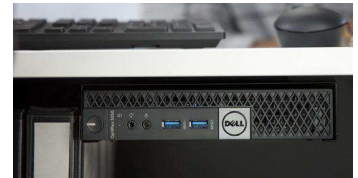
OPTIPLEX MICRO VESA MOUNT

Mount your system on a wall or under a surface with full optical drive access. Includes an adapter box to securely house the system's power adapter.