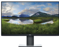
DELL 24 MONITOR - P2419H

23.8" ultrathin bezel optimized for dual display productivity. Easy Arrange feature enables multitasking efficiency and its small base frees valuable workspace.