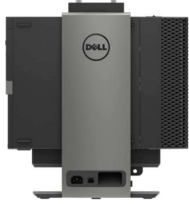
OPTIPLEX SMALL FORM FACTOR ALL-IN-ONE STAND

Small footprint mounting solution featuring integrated monitor power and Ethernet cables, as well as monitor adjustability with height, tilt, swivel and pivot functions.