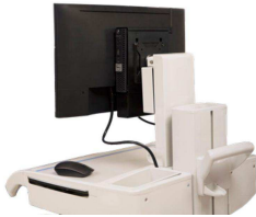
OPTIPLEX MICRO DUAL VESA MOUNT

This mount allows the Micro to be VESA mounted to select Dell E Series displays.