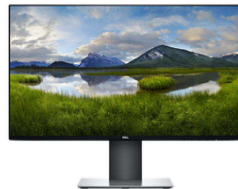
DELL ULTRASHARP 24 MONITOR - U2419H

23.8" ultrathin bezel optimized for dual display productivity. Easy Arrange feature enables multitasking efficiency and its small base frees valuable workspace.