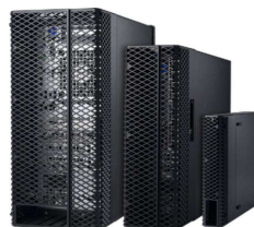
OPTIPLEX CABLE COVERS

Communicate clearly with a headset optimized to provide in-person sound quality, certified for Microsoft Skype for Business.