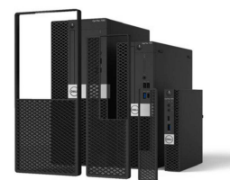
OPTIPLEX DUST FILTERS

Thermally tested custom cable covers offer an easy to install and attractive way to manage cables and secure ports.