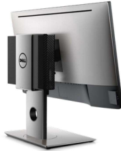
OPTIPLEX MICRO ALL-IN-ONE STAND

Small footprint mounting solution featuring integrated monitor power and Ethernet cables, as well as monitor adjustability with height, tilt, swivel and pivot functions.