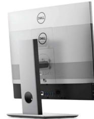
OPTIPLEX 7470 ALL-IN-ONE HEIGHT ADJUSTABLE STAND

Tilt your display forward, backward, or recline to a 60 degree angle. This stand makes touchscreen interaction comfortable.