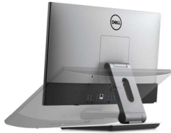
OPTIPLEX 7470 ALL-IN-ONE ARTICULATING STAND

Tilt your display forward, backward, or recline to a 60 degree angle. This stand makes touchscreen interaction comfortable.