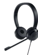
DELL PRO STEREO HEADSET - UC350

Ensure your valuable information is kept private, without compromising screen clarity. Meet new standards in protection with this anti-glare privacy screen that also filters blue light.