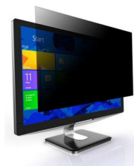
TARGUS 24" 4VU PRIVACY SCREEN

Boost This 23.8" FHD screen with 3-sided ultrathin bezels is designed for seamless multi-display productivity with your 24" All-in-One. Its small base frees valuable workspace.