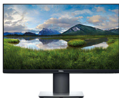
DELL 24 MONITOR - P2419H

Boost This 23.8" FHD screen with 3-sided ultrathin bezels is designed for seamless multi-display productivity with your 24" All-in-One. Its small base frees valuable workspace.