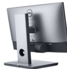
OPTIPLEX ALL-IN-ONE PORT COVER

In this custom Height Adjustable Stand, a DVD+/-RW is integrated into the base of the stand for optimal convenience.