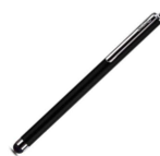
TARGUS STYLUS FOR CAPACITIVE TOUCH DEVICES

Compact design and chiclet keys, this essential desktop solution offers the convenience of wireless and clutter-free performance.