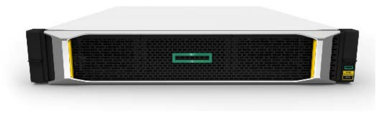
HPE MSA 2052 SAN Storage