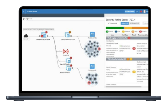
Intuitive view and clear insights into network security posture with FortiManager